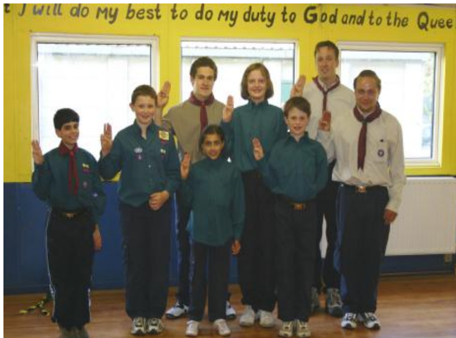
Some of the New Lambarde Troop on investiture night.